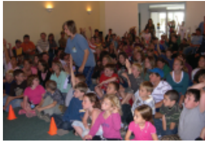
Three Schools Participated in a Presentation from the Indian River Reptile Zoo