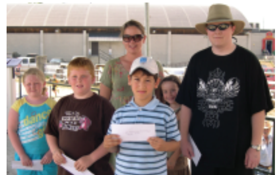
Winners of the Contest

Winners were supplied with fair passes courtesy of the Agricultural Society and BIA Bucks. Visit our website www.cscf.ca for more details.