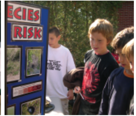
Species at Risk Information from the Lower Trent Conservation Authority