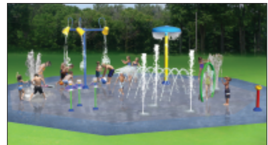
PROJECT 3 - $250,000.00 for Splash Pad Conceptual Design provided by ABC Rec.