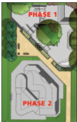
PROJECT 1 Phase I $200,000.00 and Phase II $100,00.00 for Skateboard Park Conceptual Design provided by LANDinc.

We are asking community members to "rally around" this youth inspired project and provide an individual donation. Project 1 of the Kennedy Park Revitalization (building a skateboard park), is estimated to cost $300,000. The Campbellford Skatepark Group has raised $120,000 towards this project. Your participation is critical to complete the financing for this new recreation possibility. We need to raise $80,000 from individual donations. The Campbellford/Seymour Community Foundation and the Municipality of Trent Hills will match donations to a maximum of $50,000 each. For example: When you donate $20, it would be matched by $20 from the Municipality and $20 from the Community Foundation. Therefore, your donation becomes a gift of $60.00. A tax receipt will be issued for donations of $20 or more.